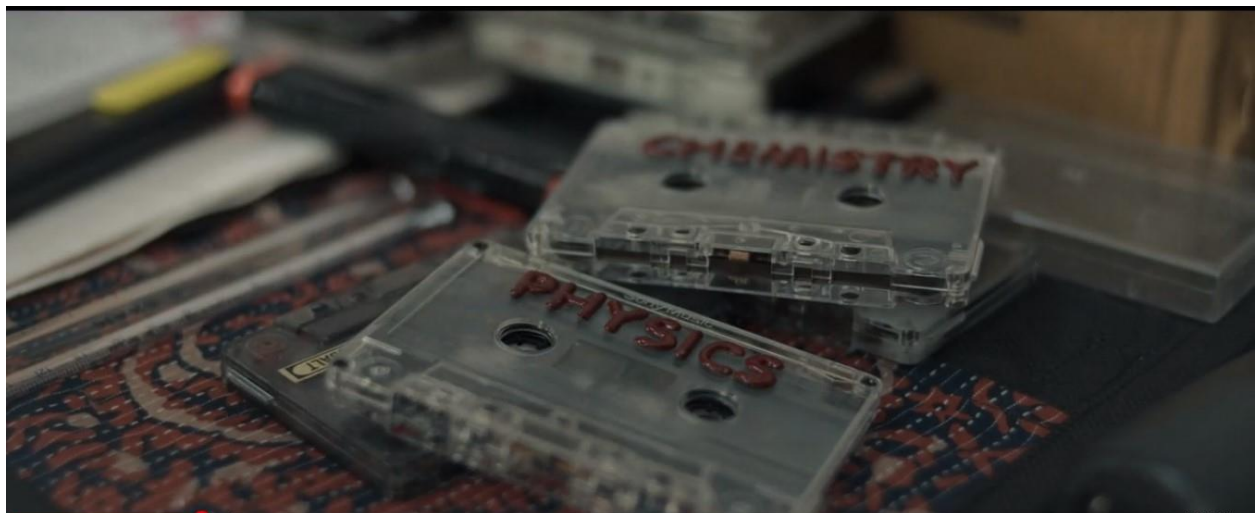
Fig. 4: The cassettes on which Devika records specific lectures for Srikanth's study. (23:09:06)