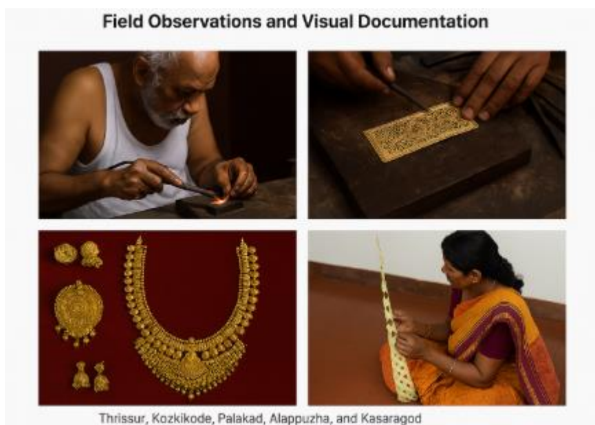
Fig. 2: Traditional Ornament Craft Processes Across Kerala

Site visits were conducted across Thrissur, Kozhikode, Palakkad, Alappuzha, and Kasaragod, regions known for their deep-rooted ornament traditions. Artisans' workshops, temple jewelry units, and community-based craft hubs were observed. Attention was given to tool use, design processes, symbolic motifs, and workspace rituals. High-resolution photographs and videos captured the making of ornaments, tools in use, and ritual applications. Visual data emphasized traditional processes like repoussé, filigree, and palm leaf work.