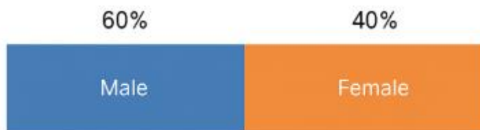
Fig 3: Gender-wise Involvement in Ornament Craft Processes

Craft knowledge is transmitted through both familial lines and community-based learning. Male artisans dominate metalwork (gold, silver), while women participate in palm leaf and bead ornaments. However, the study found a growing erosion of interest among youth due to lack of economic security.